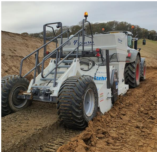
Combined Spreader and Mixer in use.