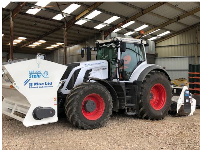
Tractor Mounted Mixer and Spreader