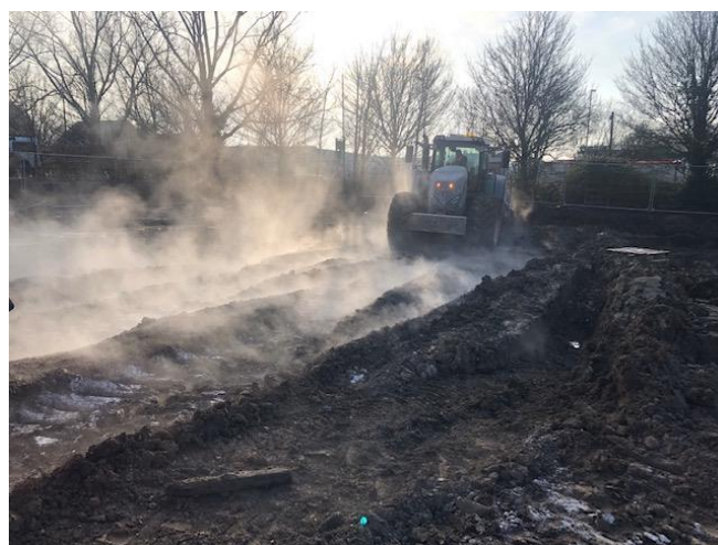
Exothermic reaction taking place during a drying process on a very wet site. Steam rising from the soil

The reaction with the quick lime also raises the alkalinity (pH) of the soil. If the soil is clayey (cohesive) and sufficient quick lime has been added to raise the pH of the soil to 12–13 (7pH being neutral). A second change takes place. The clay minerals undergo a Physical Transformation of