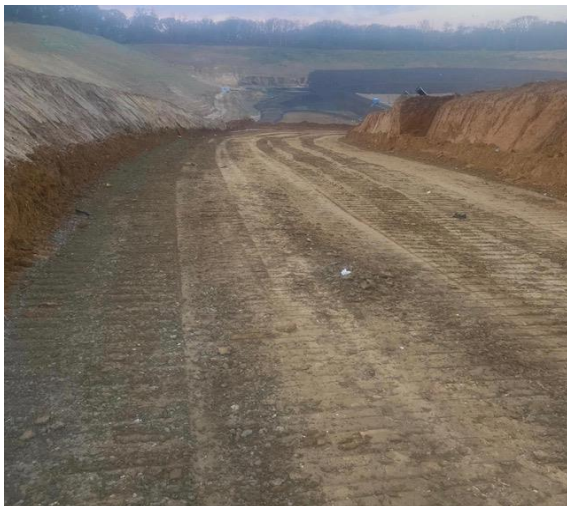
Lime and Cement stabilised Haul Road

Unlike the initial quick reaction with water, this reaction can continue over many months, even years. It is, however, very much the secondary reaction compared with the initial cementing.